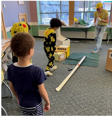
Mythaca Tiny Golf