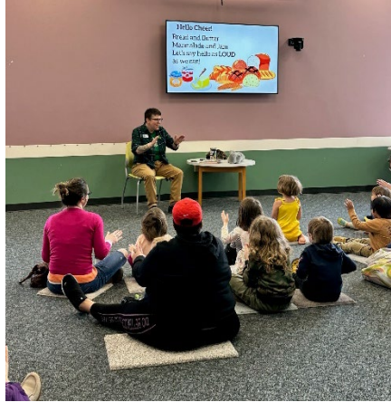
Family Storytime with Woody