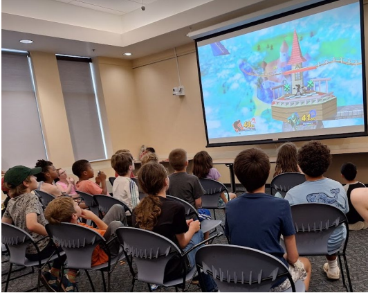
We were at capacity for the Super Smash Bros. Tournament for kids 8-12!

Child balancing an armful of Wimpy Kid and Dog Man books, plus a scavenger hunt: "May I have a writing utensil to complete the scavenger hunt?"