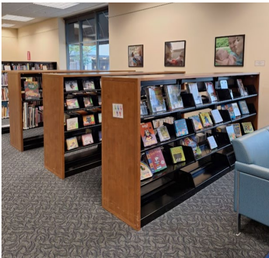
Repurposed shelves in the children's room create more light and sight lines and better highlight Oversize, Biography, Books and CD, and more.