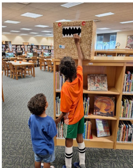
Summer Reading finishers returning their raffle tickets for completing their Adventure Map