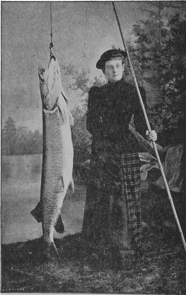
CAPTOR AND PRIZE.

In the Center of the Famous Fishing Grounds of the St. Lawrence River.