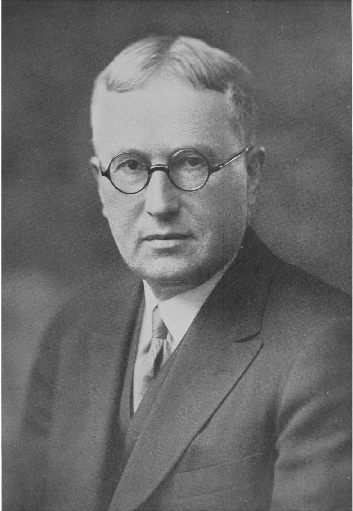
HON. JOHN TABER