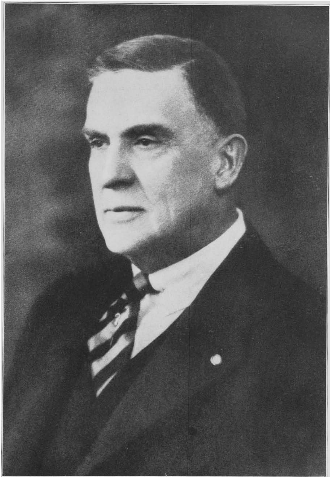
THOMAS MOTT OSBORNE