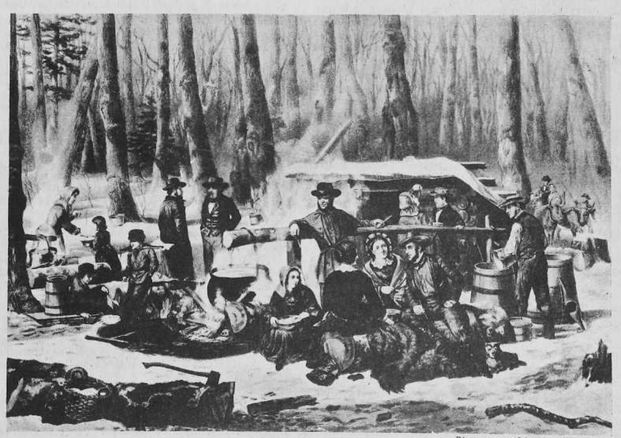
Pioneers making maple sugar.

Hung from the rafters of the cabin . . . were beans and peas, dried corn, peaches, berries, clusters of herbs for medicines and seasonings, dried and smoked beef and venison, . . . smoked hams and sausage took their places after the fall butchering season. By the time winter had shut in, the ceiling of the cabin was a veritable food storehouse.<sup>3</sup>