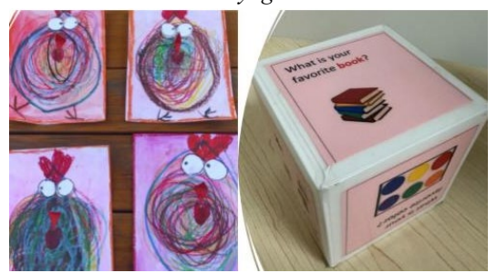
KDT features new activities for student Buddies to explore together