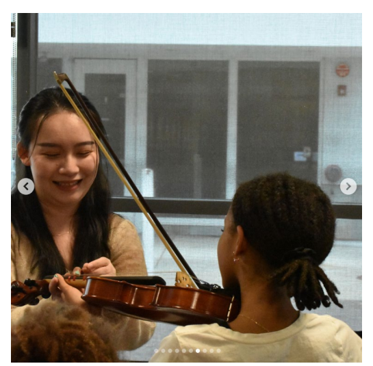
Trying out a violin after the family concert with the Cayuga Chamber Orchestra