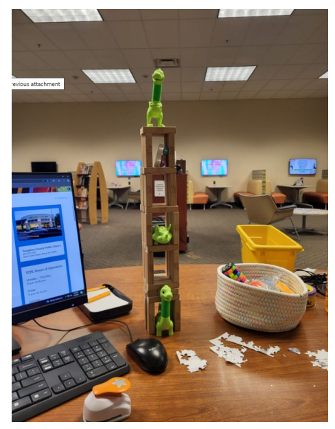
The Jenga tower Sasha built with a teen to help process tough times at school.

in a five-week bracketed round. Over 200 votes have been cast so far.