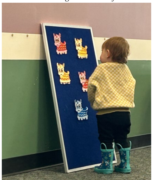
A small friend examining felt lions used for a song during Sasha's Family Storytime