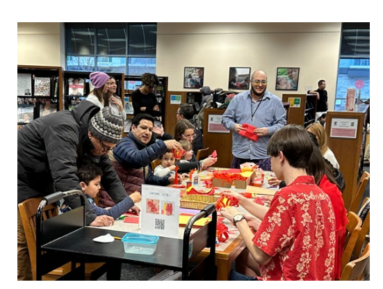
Create and Celebrate: Lunar New Year crafts and decoration making throughout the children's department