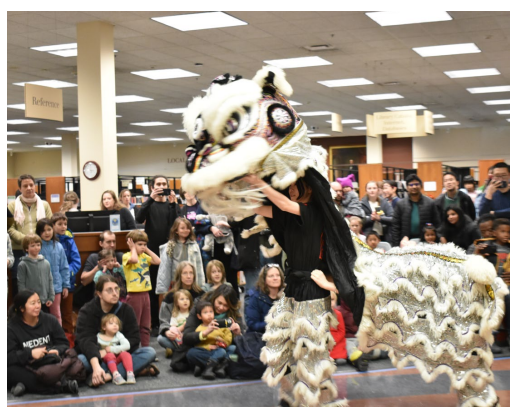
One of two Lions performing in the Avenue to ring in the Year of the Snake!