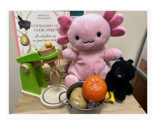
Your friends did more than just sleep during our Library sleepover! Look, we caught Stardrop & Midnight making midnight snacks for their new friends!

Animal Sleepover Storytime features staged photos of children's stuffed toys doing various activities in the library "overnight." Children get postcards of activities when they pick their friend up the next day.