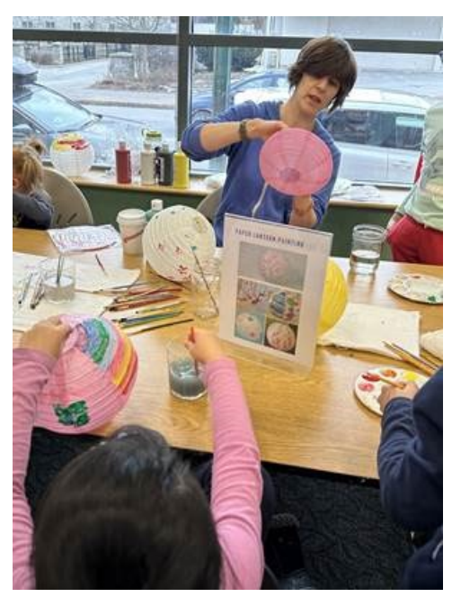
Chinese lantern painting table during Create and Celebrate. Check out the pink rainbow lantern!