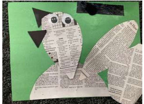
Making newsprint racoons in Story + Craft!