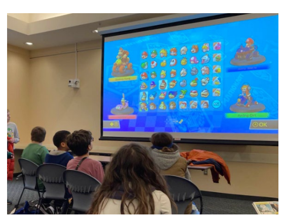
22 racers competed in our game tournament on the big screen during the school break!

that young adults may wish to delve into. The display was shared on social media and was positively engaged with. He also attended Southside Community Center's Reparations Townhall as a representative of TCPL Youth Services, as we continually seek to strengthen our connection with our community members throughout downtown Ithaca.