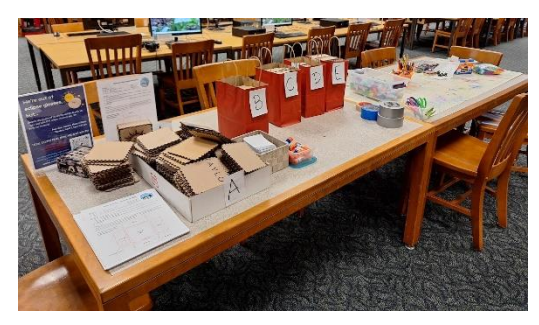
The DIY Eclipse Viewer Make and Takes in the children's department the weekend before the