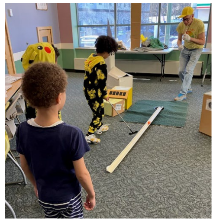
Mythaca Tiny Golf