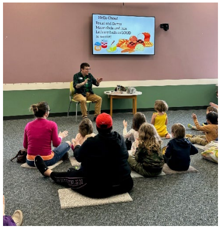
Family Storytime with Woody