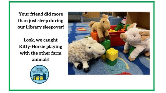
Attendees at Animal Storytime got a report of their own about what their friend got up to!