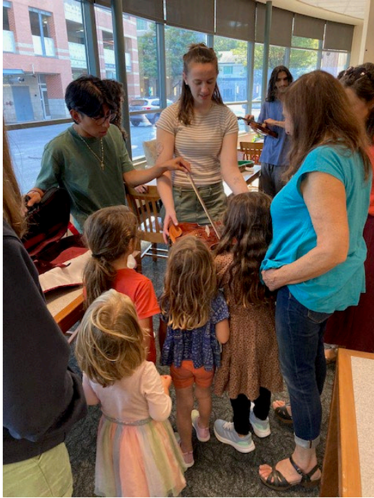
Kids “meeting” a violin after a performance by the Cayuga Chamber Orchestra. The 2024-2025 season marks the 11 th year of our partnership with CCO to present this series of live family storytimes and concerts!

introducing them to library resources and family programs. In celebration of the Mid-Autumn Moon Festival, she led a Moon-themed Family Storytime featuring books by Grace Lin, and discussed the history and traditions related to this festival, which is significant to some Asian cultures.