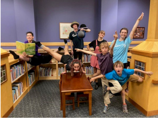
Cirque-US presented a pop-up offering of juggling workshops and acrobatic performances, closing out our summer season with a twist.