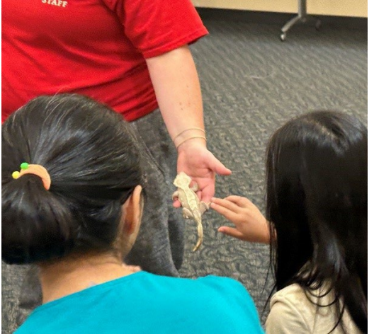
Saying hello to a lizard at Meet the Animals, presented by the Sciencenter.

join our annual Pumpkin Carving & Decorating Party , where they'll get a free pumpkin (while gourds last) to decorate. The Cayuga Chamber Orchestra Family Concert will return on October 10th for a reading and concert.