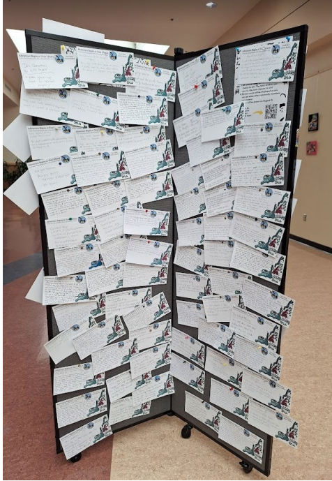
A portion of the returned Adult Summer Reading review cards