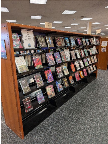
A slight shift in the way our new books are displayed offers more cover-facing books to the Avenue of Friends and makes new Large