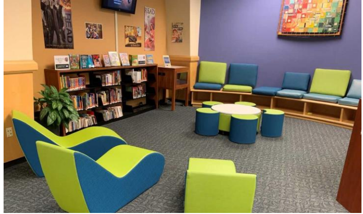
The Tween area gives tweens a distinct space separate from teens and little ones. It features an extensive collection of graphic novels for that age group, among other resources.

Located in Ithaca, New York, and founded by Ezra Cornell in 1864, Tompkins County Public Library is an award-winning library with a storied history. It serves the nearly 102,000 residents of Tompkins County, as well as library users in Cayuga, Cortland, Seneca, and Tioga counties through its role as the Central Library for the Finger Lakes Library System .