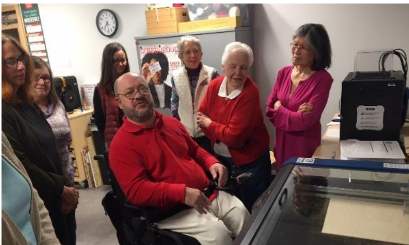
TCPL's Makerspace is a creative hub for experienced and novice makers alike. It features a 3D printer, laser cutter (pictured above), recording equipment, sewing machines, button-makers, and more.

TCPL has a designated children's area, as well as tween, teen, and adult spaces. In addition to the typical collections of books, magazines, movies, newspapers, audiobooks, and ebooks, the library features a Digital Lab, Local History room, Makerspace, Teen Center, meeting and study spaces, and two large rooms for community and library events.